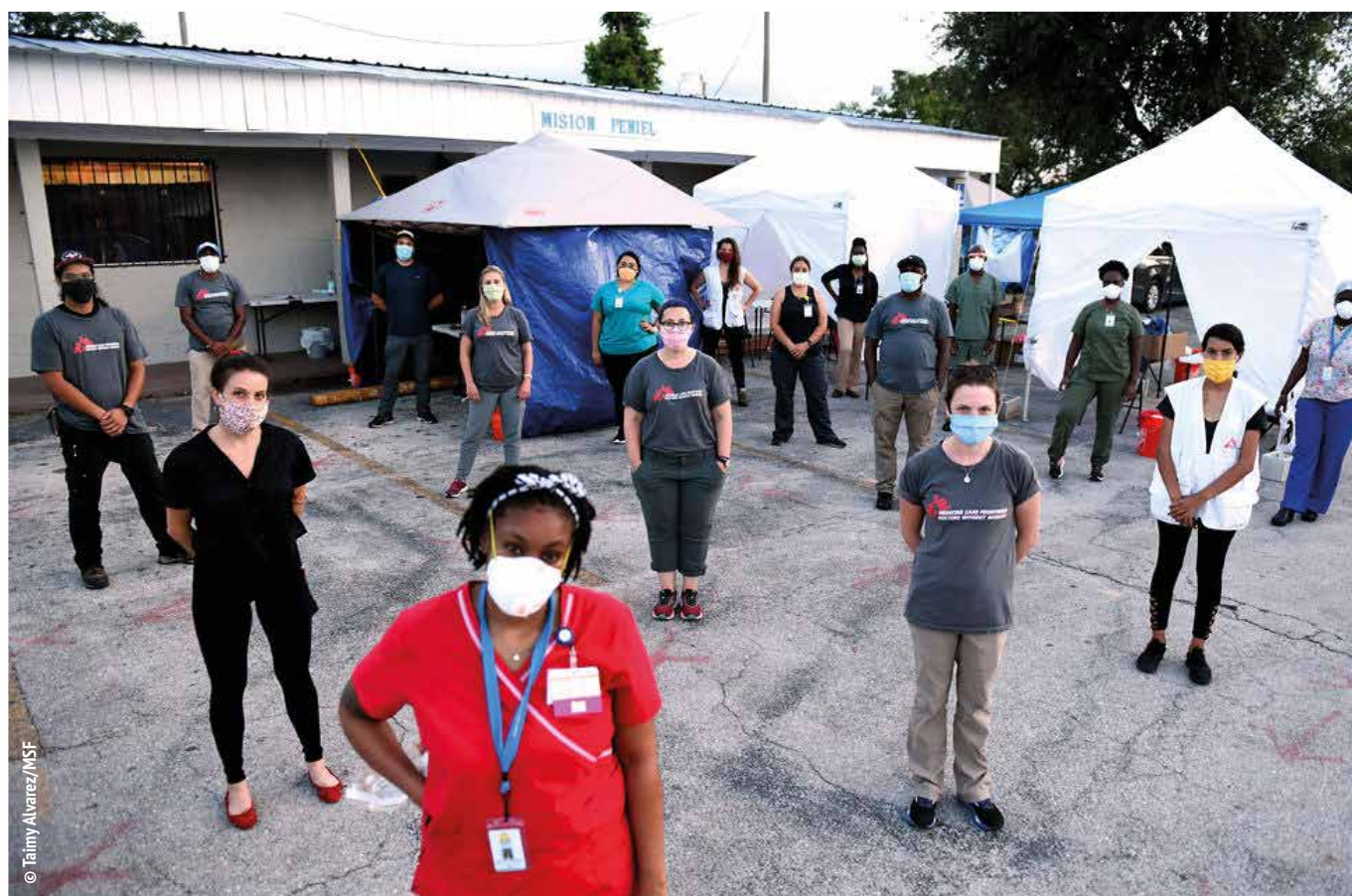
The team at a joint mobile COVID-19 testing clinic for area farmworkers in Immokalee, Florida.

In Canada , MSF teams conducted several infection prevention and control assessments- in shelters in Toronto for people facing homelessness, and in long-term care facilities in Montreal- providing recommendations to improve the overall safety of staff and patients.