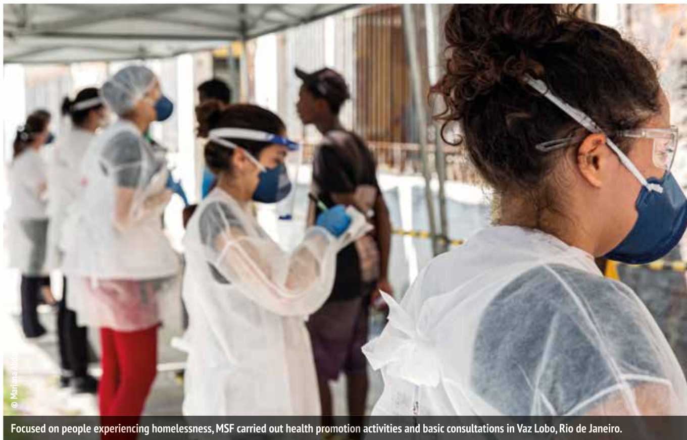
Focused on people experiencing homelessness, MSF carried out health promotion activities and basic consultations in Vaz Lobo, Rio de Janeiro.

communities, and drug users. In early April, MSF's migrant health project for Venezuelan refugees in Boa Vista urgently scaled up isolation and treatment facilities after several patients were confirmed with COVID-19. In Rio de Janeiro, MSF supported the Ministry of Health with setting up a 200-bed COVID-19 hospital and with engagement activities in several communities around the same time. During May, MSF started working in 15 health facilities in all of Brazil, directly managing nearly 170 beds for COVID-19 patients, holding over 1,500 outpatient consultations, and admitting 274 patients to clinics for stationary care.