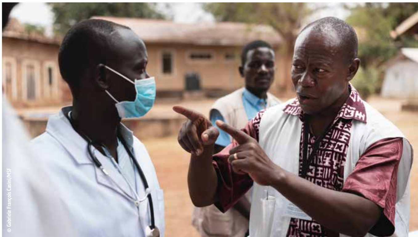
MSF staff demonstrating the correct use of masks during an infection prevention and control training in Juba, South Sudan.

ambulance services for both COVID-19 patients and other emergencies in Nairobi, with emergency calls sharply increasing in April. Health awareness campaigns, case management and infection prevention trainings were gradually rolled out over the course of April and May in several health facilities in Nairobi, Kiambu, Garissa and Mombasa Counties. Regular HIV activities and specialized care for victims of sexual violence had to be reduced or reorganized at the onset of the pandemic but could be largely maintained by offering psychological support over the phone and providing patients with larger quantities of antiretroviral drugs.