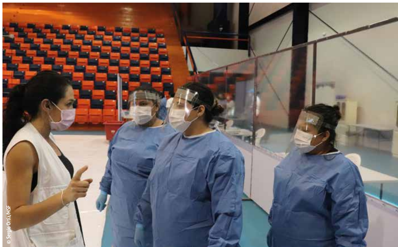
In Mexico, MSF set up a COVID-19 treatment centre in a basketball arena in Tijuana.

In Mexico , at the beginning of April MSF called for the closure of migrant detention centres in light of the pandemic, while stepping up its response in migrant shelters and camps in Matamoros and Reynosa, along the U.S. border. In early May, MSF teams installed an auxiliary hospital unit in a basketball stadium in Tijuana, offering treatment to non-critical COVID-19 patients, and assumed management of an extension unit for intensive care at a local hospital with 50 beds and respiratory support.