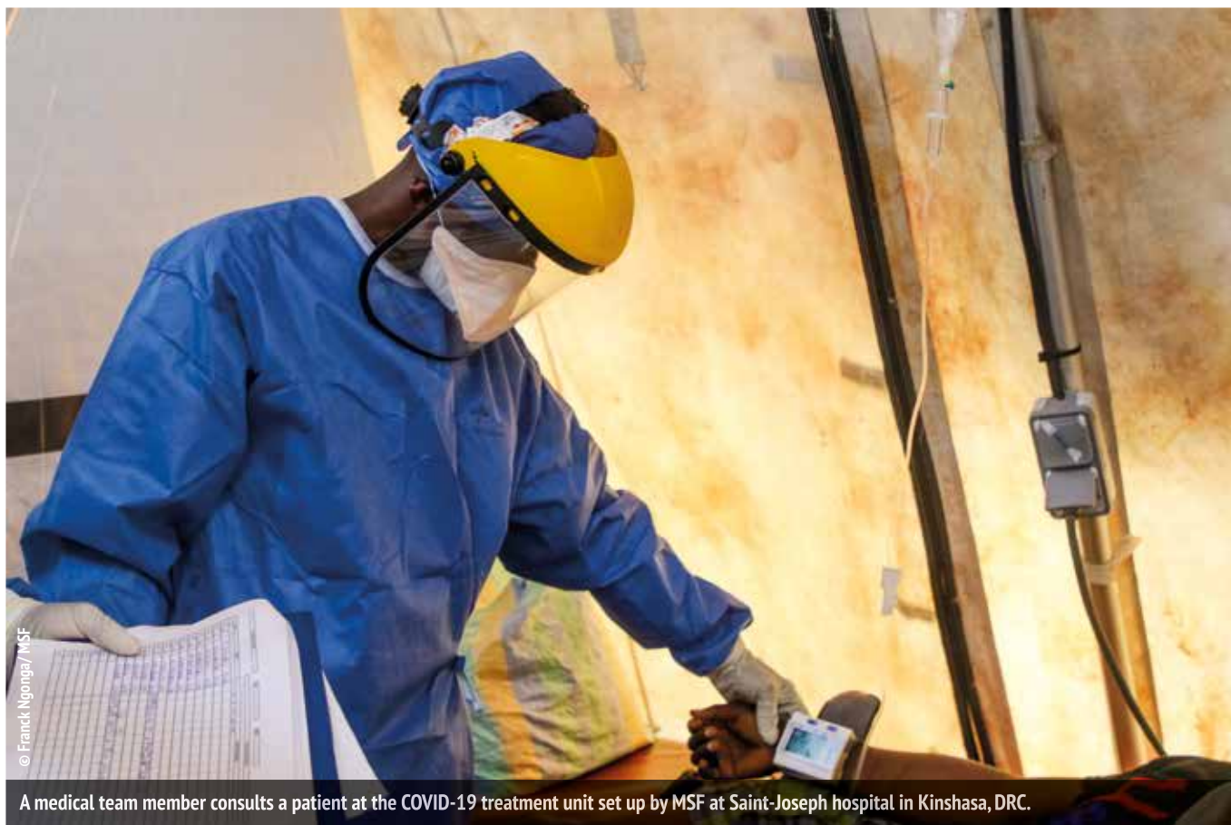
A medical team member consults a patient at the COVID-19 treatment unit set up by MSF at Saint-Joseph hospital in Kinshasa, DRC.

COVID-19 patients. In Goma and Kinshasa, MSF initiated large-scale production of cloth masks locally with over 20 workshops, to help prevent transmissions outside of hospitals.