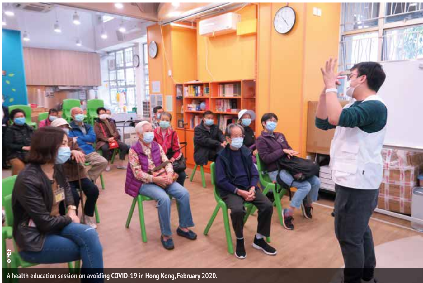
A health education session on avoiding COVID-19 in Hong Kong, February 2020.

at heightened risk of contracting the virus and lacking access to primary healthcare. Over the course of February and March, MSF teams also ran several mental health workshops covering coping mechanisms for stress and anxiety. In mid-February, MSF dispatched 4.5 tons of urgently needed personal protective equipment to Wuhan and Hong Kong .