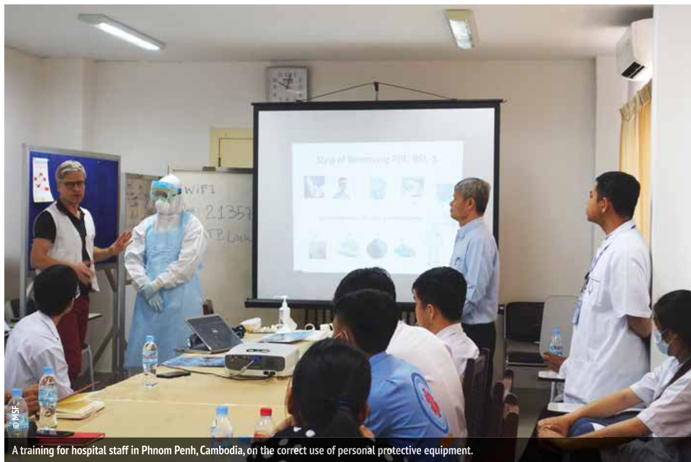
A training for hospital staff in Phnom Penh, Cambodia, on the correct use of personal protective equipment.

Initial capacity building on preparedness and appropriate infection prevention and control measures took place in MSF projects treating hepatitis C in Cambodia , and a tuberculosis programme in Port Moresby, Papua New Guinea , in early March. These hands-on training sessions covered practical aspects from stocking the right medical supplies and correctly wearing personal protective equipment, to setting up triage points and treating COVID-19 patients in dedicated isolation wards. Similar training sessions were held in March and April in three Cambodian provinces at the border to Thailand, and in Banten, Indonesia , in combination with training on providing mental health support.