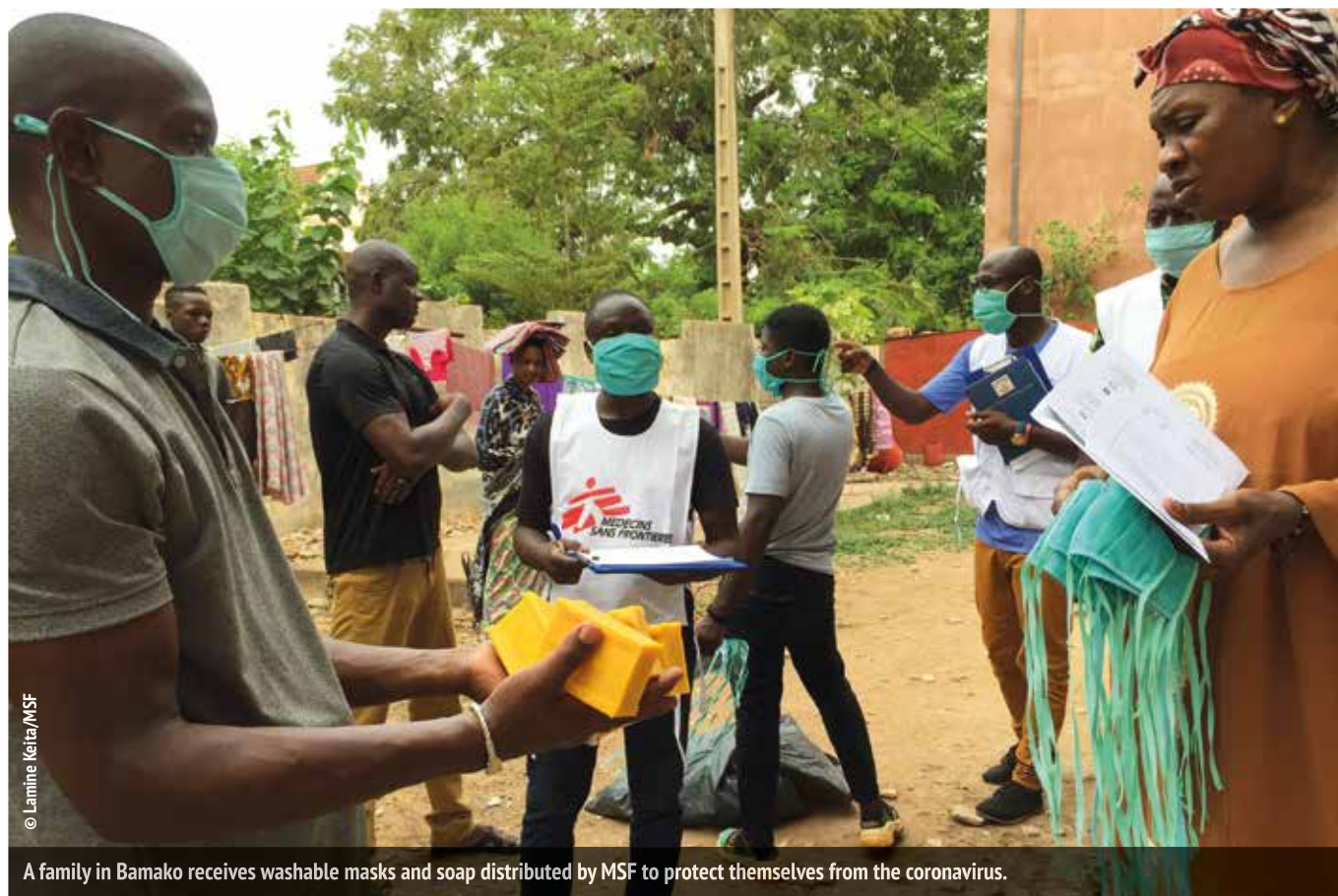
A family in Bamako receives washable masks and soap distributed by MSF to protect themselves from the coronavirus.

In Conakry, Guinea , MSF rehabilitated one of its former Ebola treatment centres that had been handed to the Ministry of Health, and transformed it into a COVID-19 isolation and care centre to accommodate 75 stable or mild patients. In Kouroussa, MSF also supported setting up a 12-bed isolation ward in the prefectural hospital.