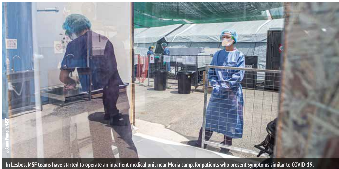
In Lesbos, MSF teams have started to operate an inpatient medical unit near Moria camp, for patients who present symptoms similar to COVID-19.

In Greece from mid-March, MSF called for the evacuation of high-risk patients with chronic diseases and elderly people from the camps on the Greek islands, where more than 30,000 people lived in overcrowded tents or containers with limited access to running water and sanitation services. In mid-April, Greek authorities made the announcement to move more than 2,000 people to hotels and other accommodations on the Greek mainland as a preventive measure. Working in camps in Lesbos and Samos, MSF teams increased health messaging, water and sanitation services and the delivery of protective equipment, and recruited additional medical, paramedical, and support staff. In May, MSF started operating a 40-bed inpatient medical unit for patients with COVID-19 symptoms near the Moria reception and identification centre.